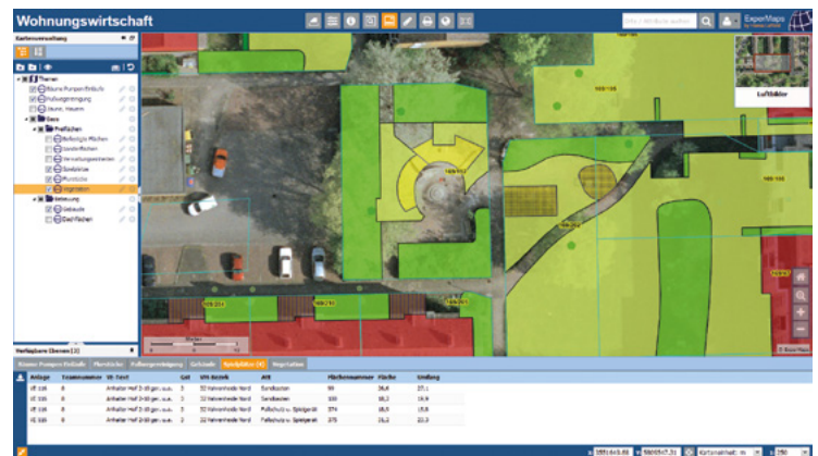
Alphanumeric information about all displayed objects in map extent